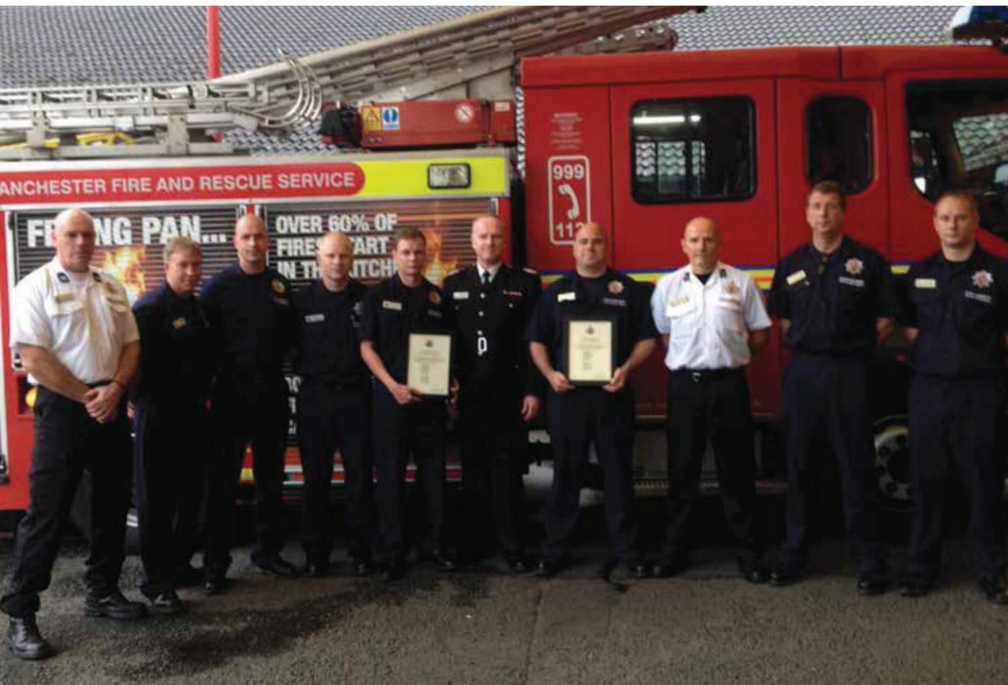
(ABOVE) WHITE WATCH AT MANCHESTER CENTRAL RECEIVE THEIR CERTIFICATE OF OUTSTANDING PERFORMANCE

"It's also about the firefighters' families, friends and colleagues being able to take pleasure in their work being recognised."