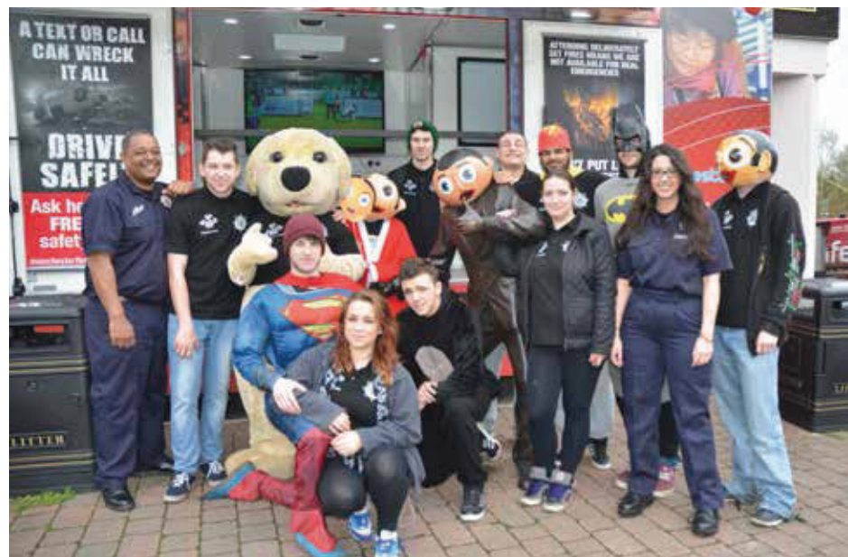
(ABOVE) THE PRINCE'S TRUST TEAM PROVIDES ENTERTAINMENT FOR THE CROWDS