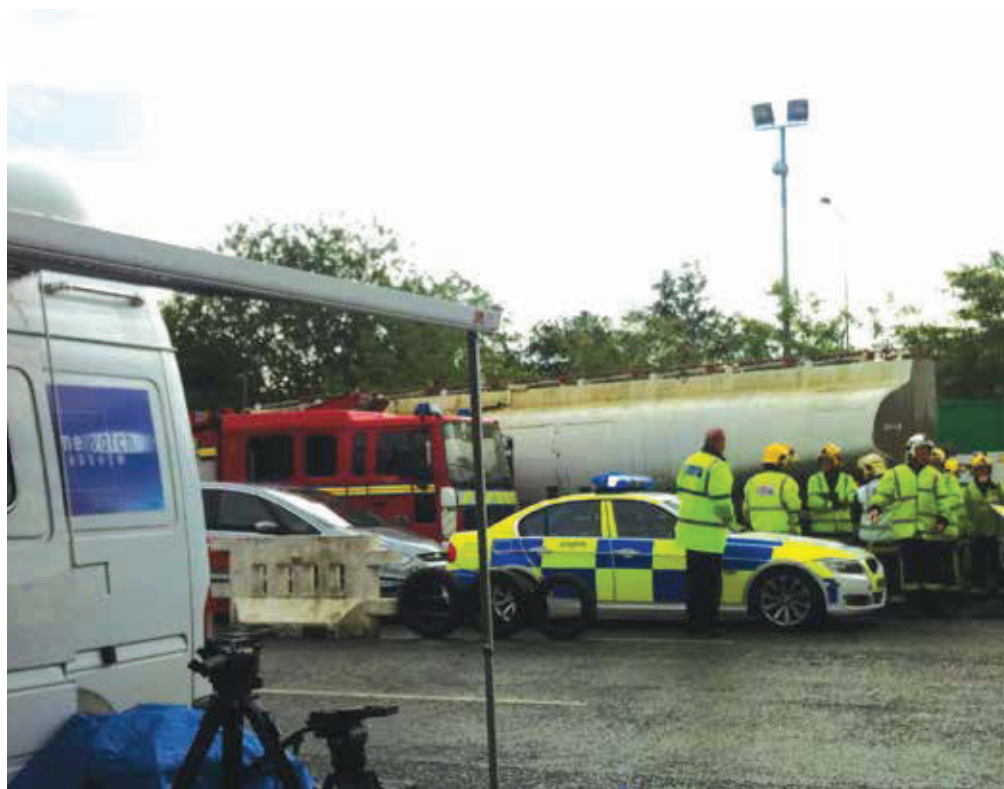
(ABOVE) POLICE AND AMBULANCE COLLEAGUES JOINED FIREFIGHTERS FOR THE FILMING

"Highlighting the importance of not taking risks like speeding on the roads – it launched a week-long campaign in Wigan Borough."