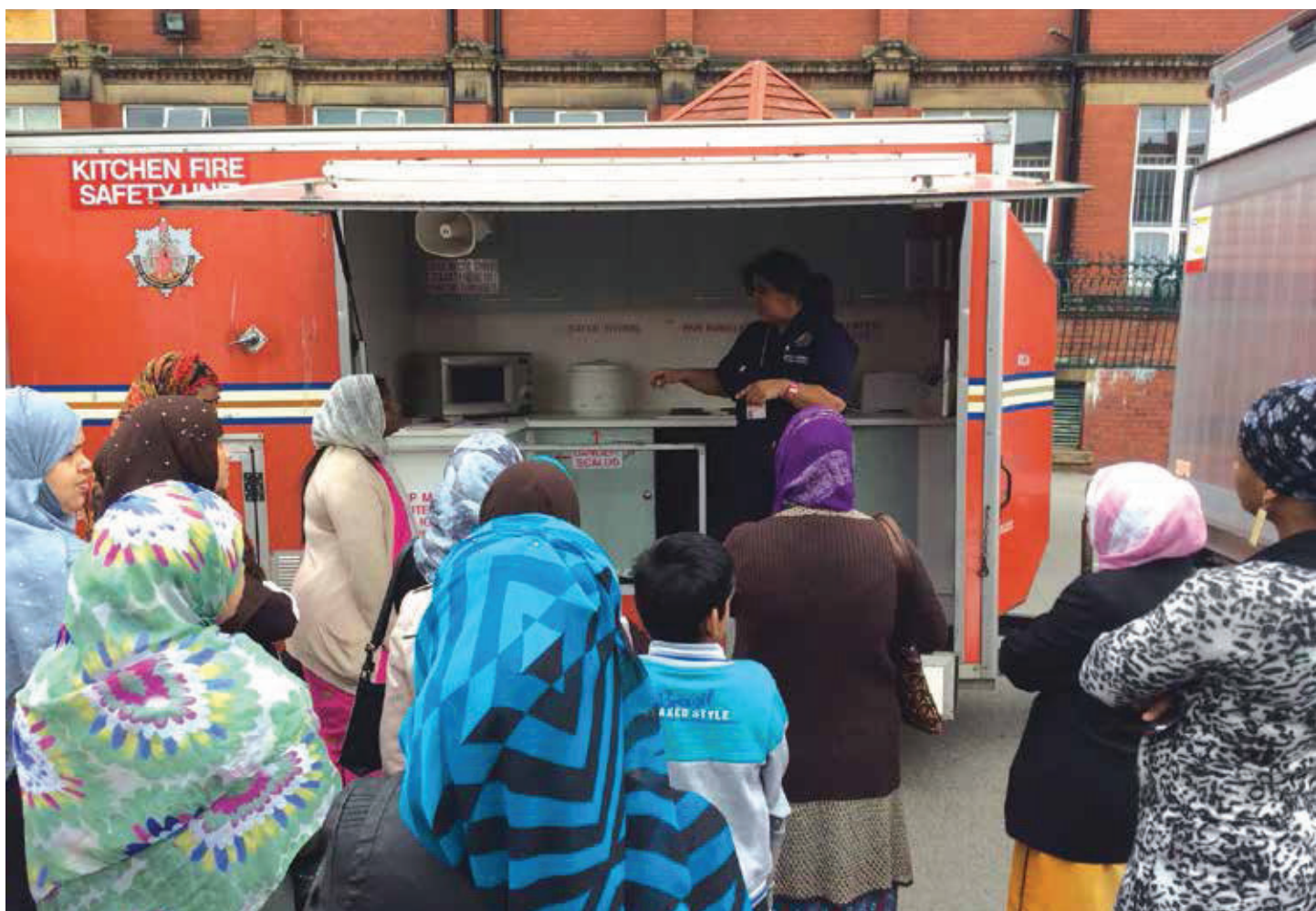
(ABOVE) PARENTS WATCH THE CHIP PAN GO UP IN FLAMES

“Hopefully parents and children learned something and the young people can be our loose clothing and cooking safety advocates on behalf of GMFRS.”