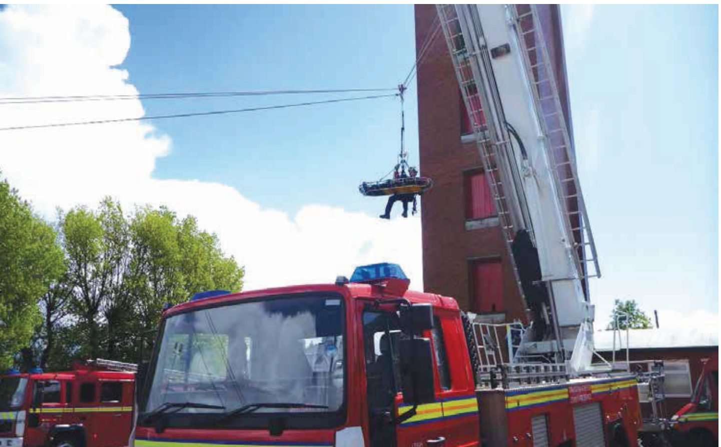
(ABOVE) FIREFIGHTERS PERFORM A ROPE RESCUE DEMONSTRATION

Bolton Mountain Rescue Team Leader Gary Rhodes said: "The heavy rain showers didn't diminish the interest from the community because thanks to GMFRS it was an interesting day out."