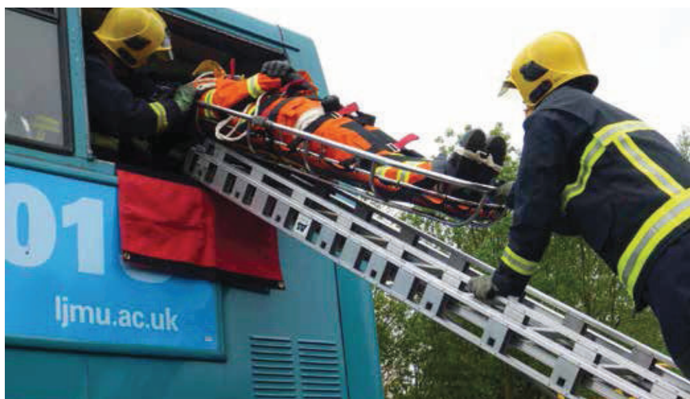
(RIGHT) FIREFIGHTERS RESCUE A 'CASUALTY' FROM THE CRASHED BUS

The driver of the bus was trapped in his seat and an upper floor passenger was injured – requiring extricating from the first floor window.