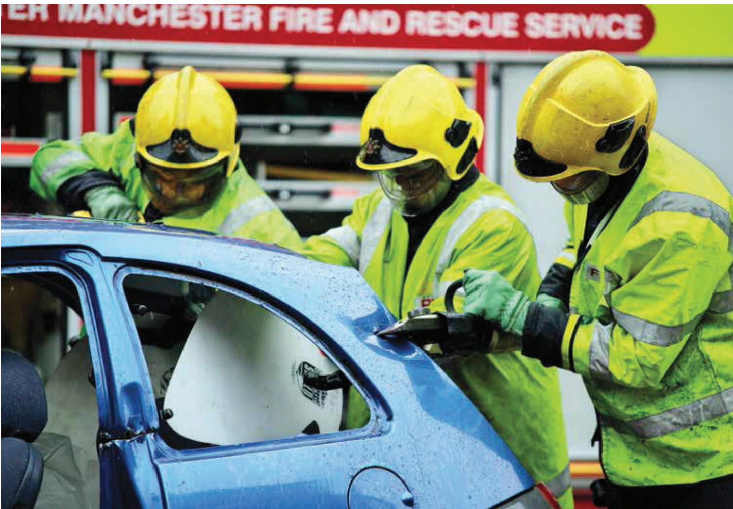
(ABOVE) CREW USE HYDRAULIC CUTTING GEAR ON THE CAR

"They can leave drivers and passengers with life-changing injuries, so we were working to make sure drivers, particularly young people knew how to keep themselves and their passengers safe."