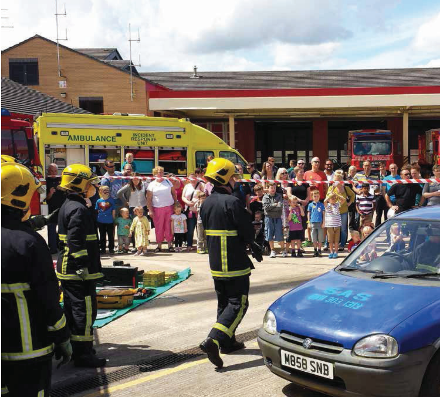
(ABOVE) STUNNED CROWDS WATCH FIREFIGHTERS CUT THE ROOF OFF A 'CRASHED' CAR