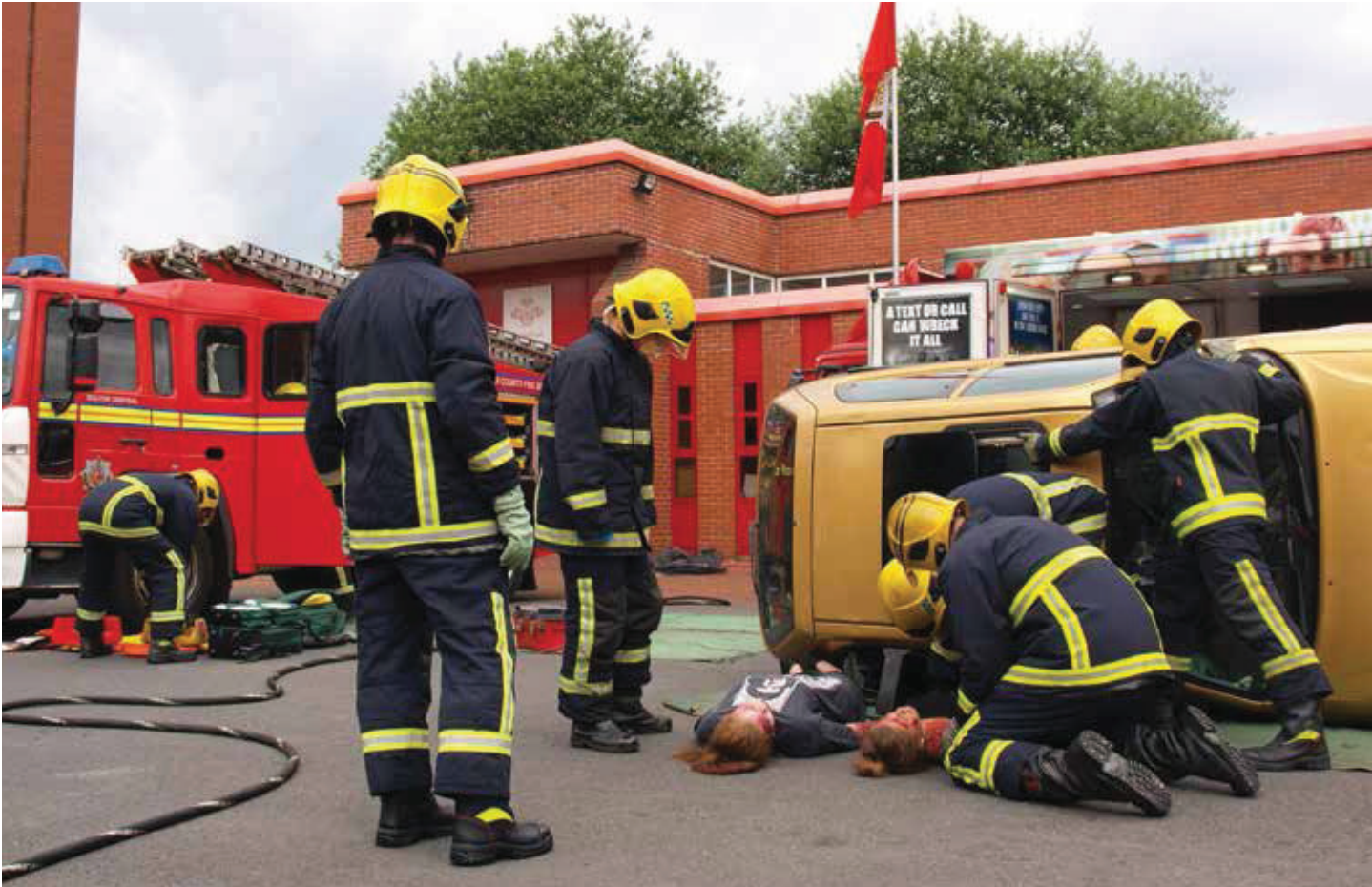
(ABOVE) FIREFIGHTERS GIVE AN RTC DEMO WITH COLLEGE STUDENTS AS 'CASUALTIES'