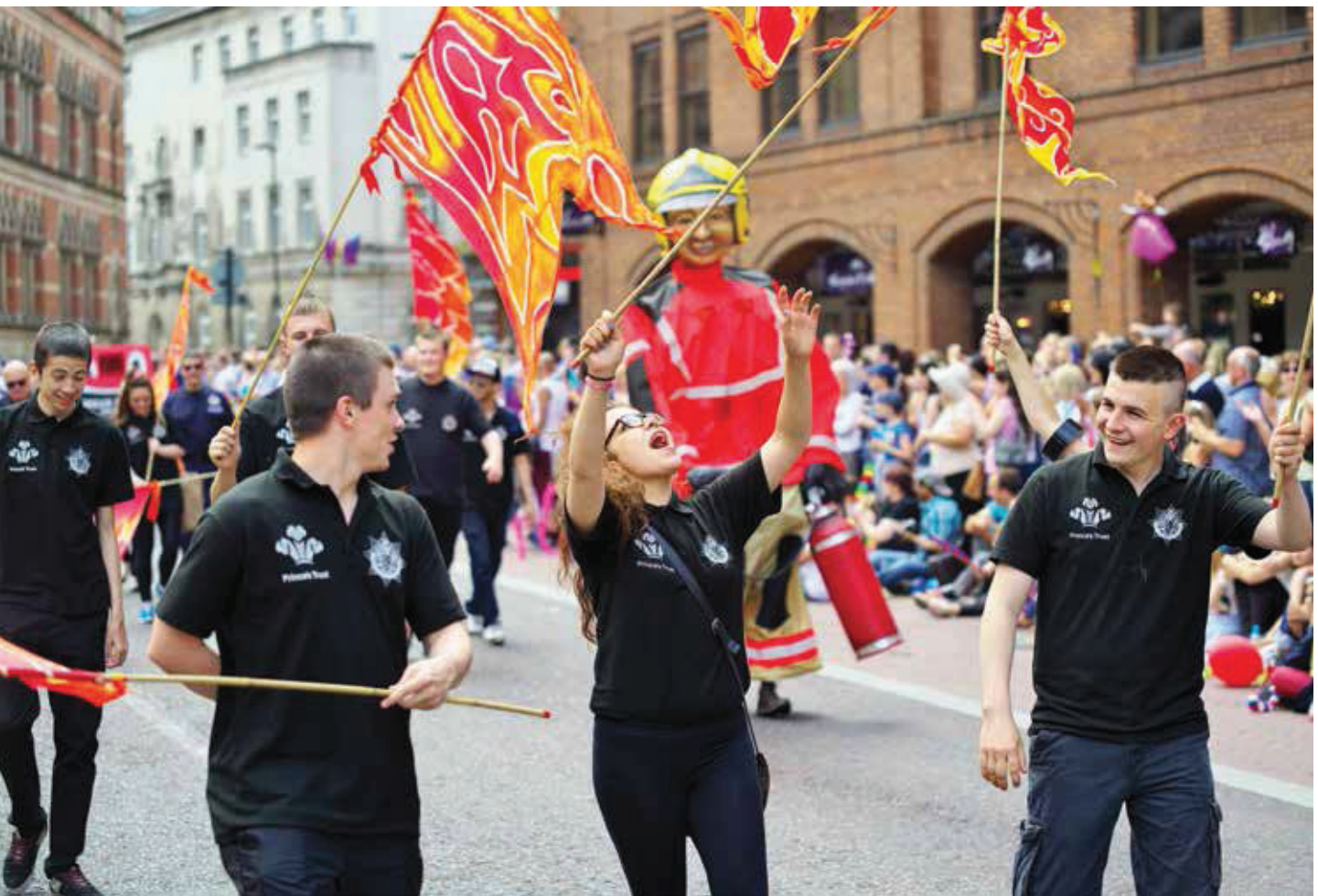
(ABOVE) THE TEAM HAVING FUN WITH THEIR FLAGS AND THE FIREFIGHTING PUPPET DURING THE MANCHESTER DAY PARADE

"But as the young people got ready to begin the parade, the nerves soon passed and they really enjoyed being a part of the day. I was really impressed with the turn out of the team and the feedback we have received has been fantastic."