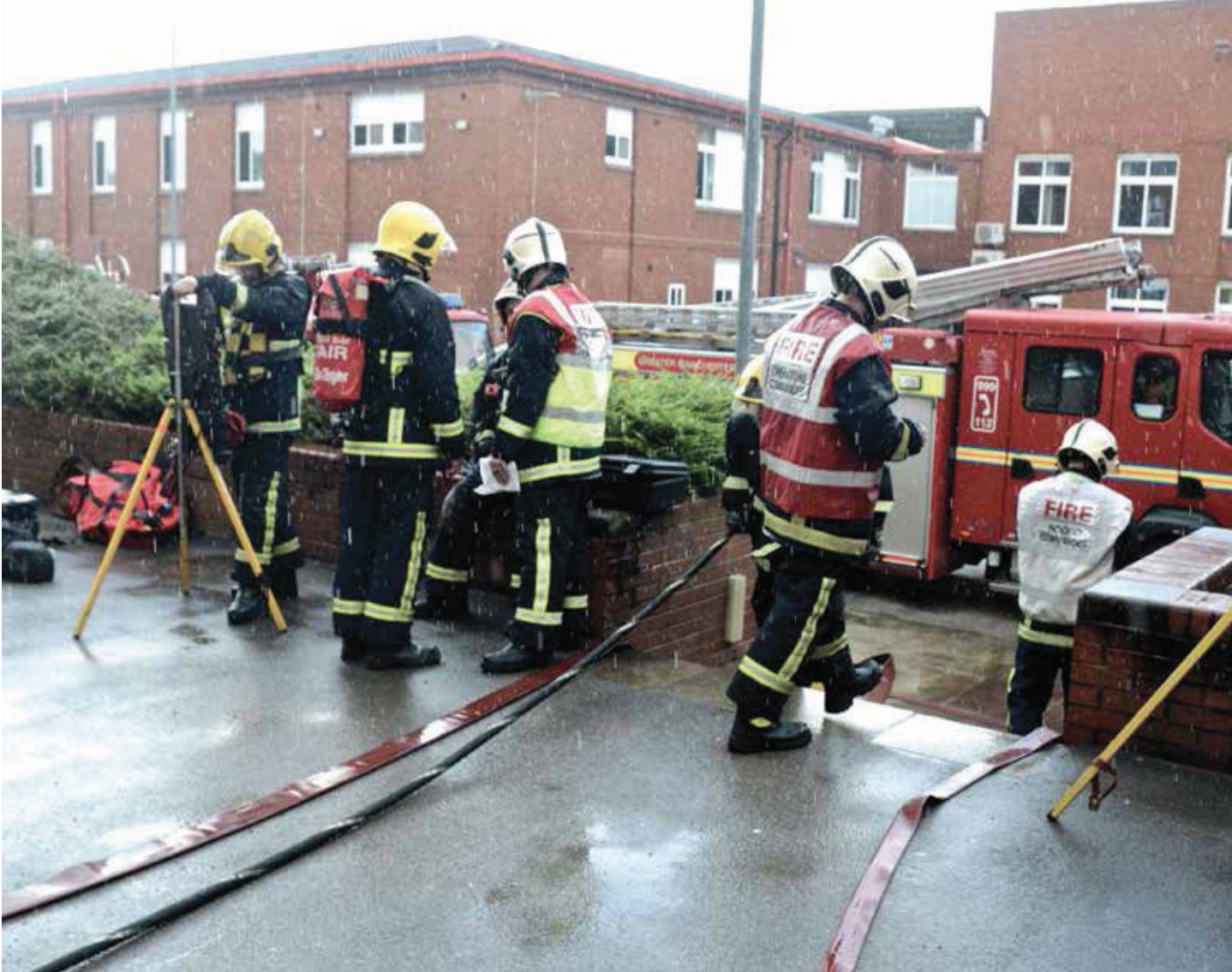
(ABOVE) FIRE CREWS TAKE PART IN EXERCISE WITH STEPPING HILL HOSPITAL