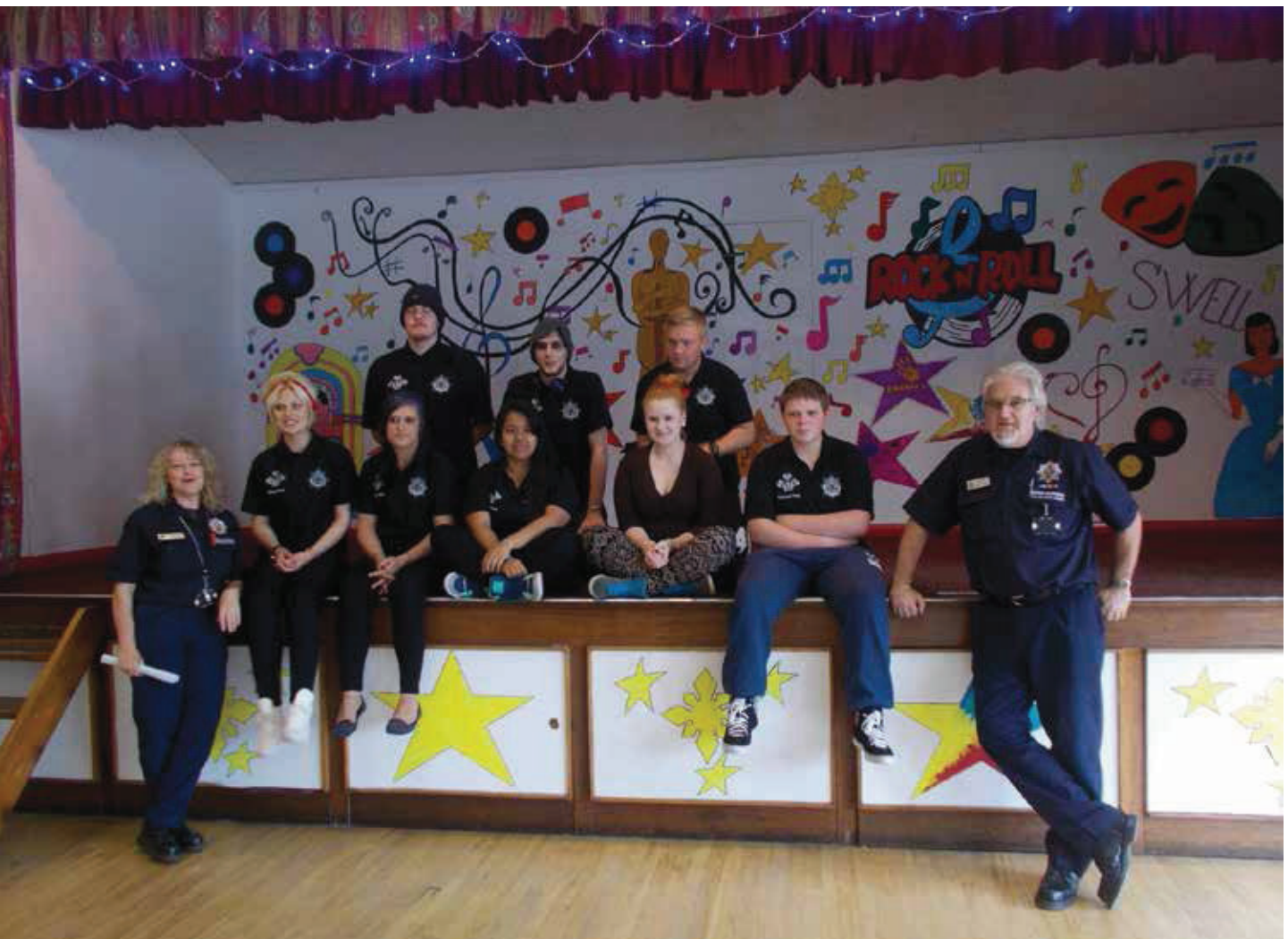
(ABOVE) THE YOUNGSTERS SHOW OFF THEIR ARTISTIC WORK

The money was spent on providing play equipment and re-painting the main hall and stage area at the centre – an injection of colour on the main wall and a 50s themed mural painted on the stage brought a new lease of life to the centre.