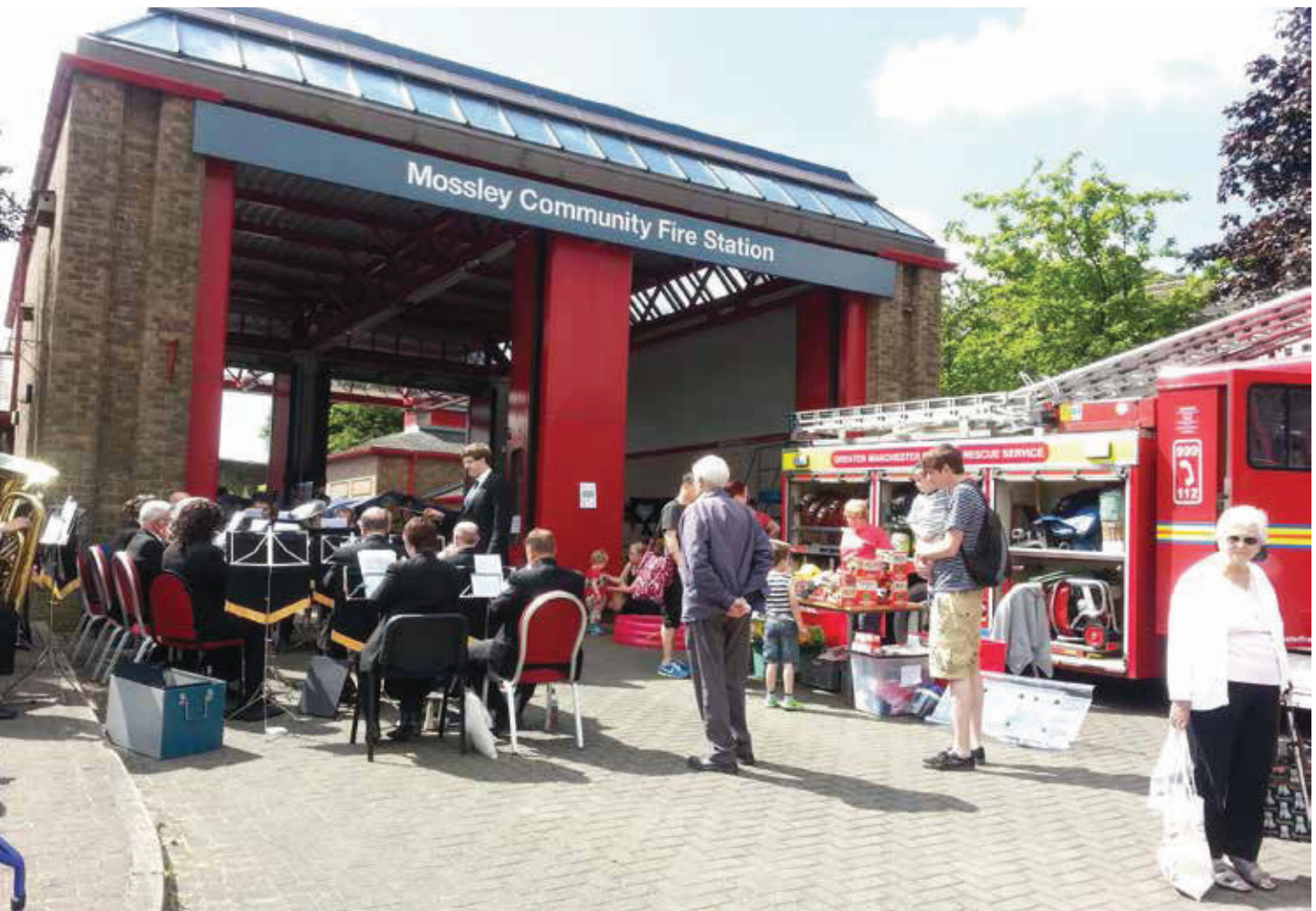
(ABOVE) THE PUBLIC ENJOY A LOCAL BRASS BAND DURING THE CELEBRATIONS

The GMFRS stall raised over £250 alongside a fantastic donation of £75 for The Fire Fighters Charity from the Mossley Community Town Team.