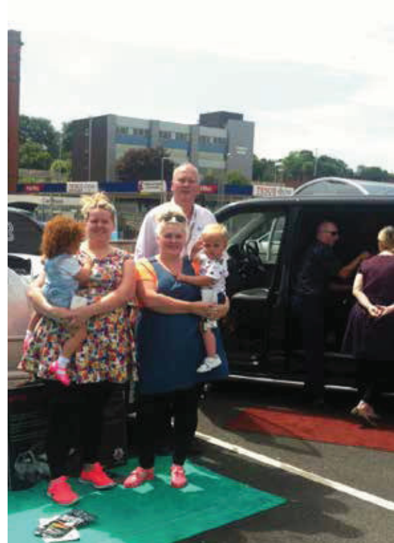
(BELOW) SHOPPERS TAKE A VIRTUAL RIDE IN THE DRIVING SIMULATOR

The driving simulator was at the events that took place at Tesco in Middleton and Heywood, with shoppers taking the opportunity to test their skills behind the wheel.