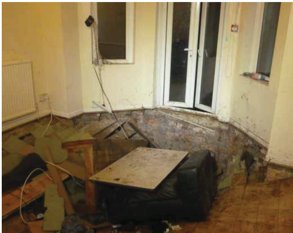
(ABOVE) THE DAMAGE DONE BY STUDENT REVELLERS DANCING ON ROTTEN TIMBERS

The incident led to a safety plea by GMFRS for people to take extra care around water.