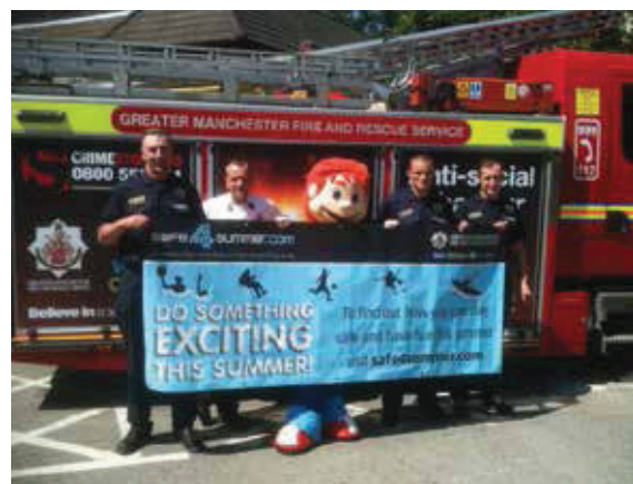
(ABOVE) GREEN WATCH GET WACKY WITH THEIR SUMMER SAFETY MESSAGE

“We were able to chat to mums and dads about things like the importance of keeping young children away from open water in the hot weather.