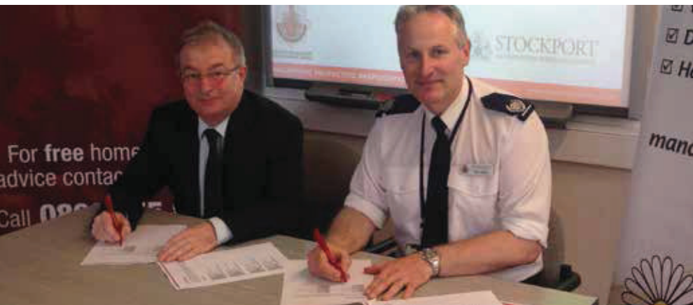
(ABOVE) PARTNERSHIP WITH STOCKPORT COUNCIL HELPS TO KEEP RESIDENTS SAFER AT HOME