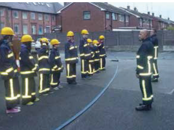
(ABOVE) FIREFIGHTER SUZ MEMBER WITH SOME OF THE YOUNG PEOPLE