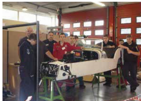
(ABOVE) THE YOUNG CARERS ON THE FIRST EVENING BUILDING THE CATERHAM CAR

This includes commitments to ensure sufficient educational leisure-time activities are available and improving the publicity of information to ensure children and families can easily access information about what's on and supporting with funding bids to bridge the gap in youth service provision.