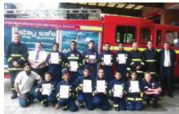
(BELOW) BOYS FROM THE JAMIA ISLAMIA SCHOOL COMPLETE THEIR FIRETEAM50 PROGRAMME

FireTeam 50 came about thanks to PIMB (Partnerships and Innovation Management Board) funding for three cohorts.