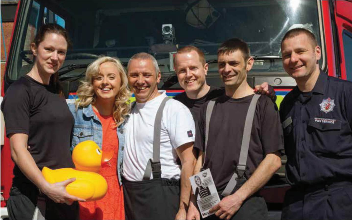
(ABOVE) SALFORD BLUE WATCH WITH CBBC PRESENTER KATIE THISTLETON AT SALFORD QUAYS