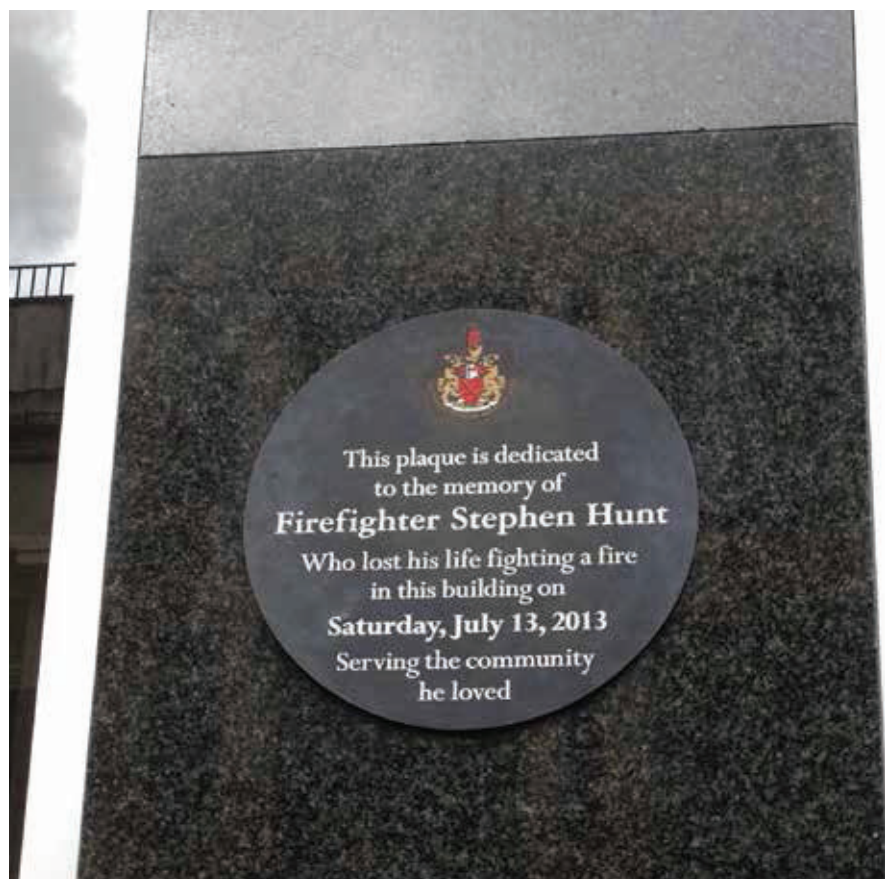
(ABOVE) THE PLAQUE PROUDLY STANDING ON THE BUILDING WHERE STEPHEN DIED