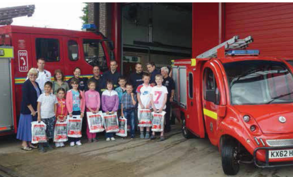
(ABOVE) THE YOUNGSTERS WITH THEIR GOODIE BAGS AND THE FIRE ENGINE