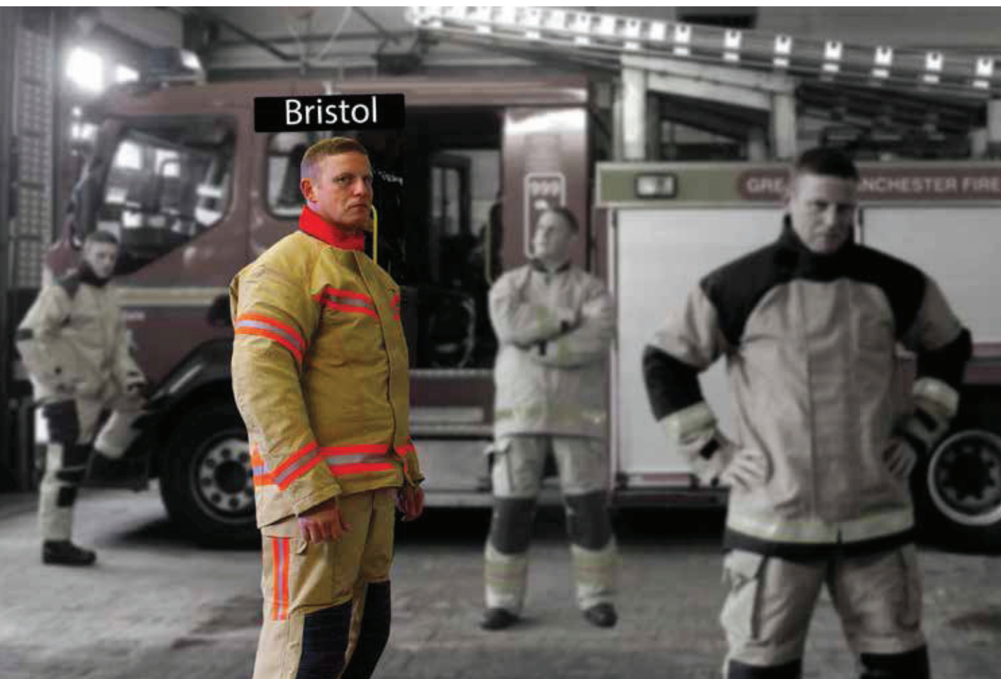
(ABOVE) THE MIDDLE AND OUTER LAYERS OF GMFRS' NEW PPE

Feedback was compiled from these tests while a survey issued to operational staff generated more than 1,000 responses.